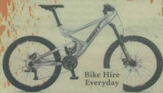
Bike Hire Everyday

• We maintain a modern well maintained fleet of bikes